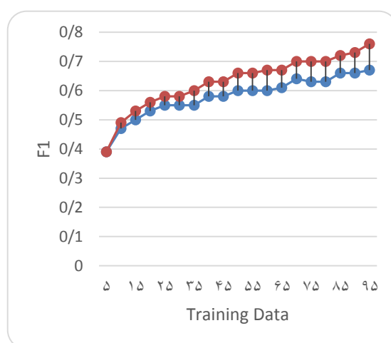
Figure 4: Comparing the practicality of SVM classifier when using features generated by the proposed semantic kernel (the red series) and vector space kernel (the blue series) for a certain percentage of training data.

Since in the vector space kernel [22, 31], synonymous terms or terms with multiple meaning were not properly covered; such a problem was possible to be predicted. By transferring data to the new feature space by the proposed semantic kernel, classification error rate between the two groups “knowledge and culture” and “community” was reduced to 19 cases; because many synonymous terms were