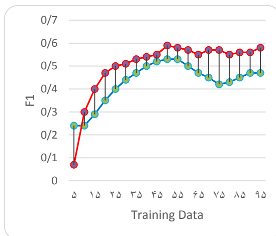
Figure 3: Comparing the practicality of Naïve Bayes classifier when using features generated by the proposed semantic kernel (the red series) and vector space kernel (the blue series) for a certain percentage of training data.

meaning. For instance, in a sample running, 25 documents that belonged to "science and culture" class have been classified by mistake in "society".